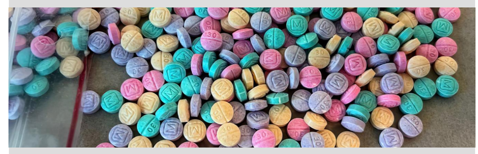
Rainbow Fentanyl Pills - Image Credit: Drug Enforcement Administration

According to DEA Administrator Anne Milgram, "Rainbow fentanyl – fentanyl pills and powder that come in a variety of bright colors, shapes, and sizes – is a deliberate effort by drug traffickers to drive addiction amongst kids and young adults."